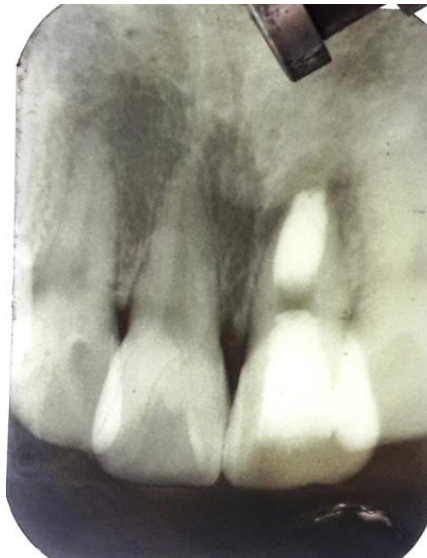
Figure 2: Immediate postoperative