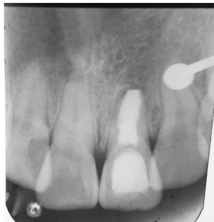
Figure 3: Recall IOPA after 3years