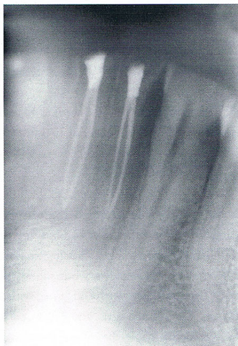
Figure: II Obturation completed & Zinc Phosphate interim restoration placed

Access cavity was prepared in both 31 and 32 under local anaesthesia and pulpal remnants were removed with barbed broach. Pulp chamber was flushed copiously with sodium hypochlorite solution then