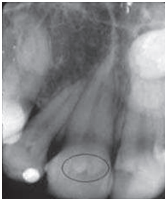
Fig 4 (a): Intra Oral Periapical Radiograph of 11, 21 showing teeth larger than normal