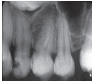
Fig 4 (b): Intra Oral Periapical Radiograph of 22,24,25 showing teeth larger than normal, also shows impacted 23