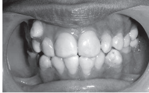
Fig 2: Generalized macrodontia of maxillary and mandibular teeth