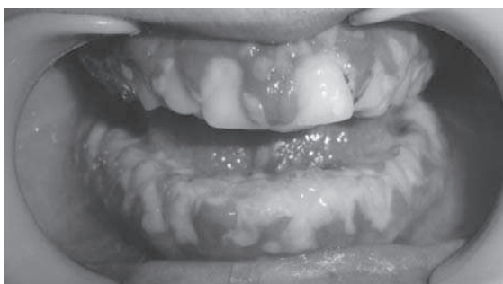
Fig 1: Necrotic slough covering interdental papilla and marginal gingiva

After 15 days, the ulcers had healed and necrotic slough was completely absent. Slight inflammatory enlargement was seen in the maxillary anterior labial and interdental papilla (Fig 4). There was a need for gingivoplasty to reduce the plaque retentive areas but was postponed until 6 months due to her pregnancy. Patient was advised to maintain oral health by regular dental visits and strict oral hygiene practice.