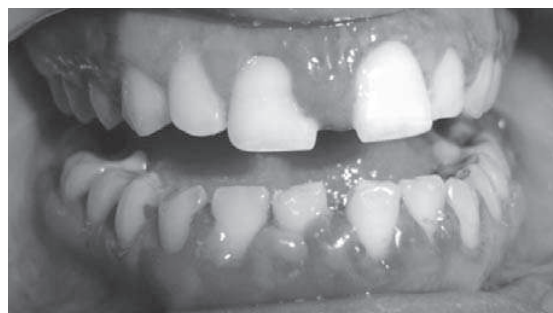
Fig 4: 4th visit-ulcers are healed, only inflammatory enlargement is seen