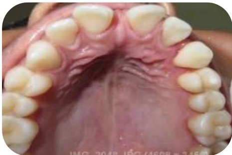
Fig 5: Post-operative photograph (9 month follow-up)