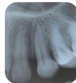
Fig 2: Intraoral Periapical radiograph