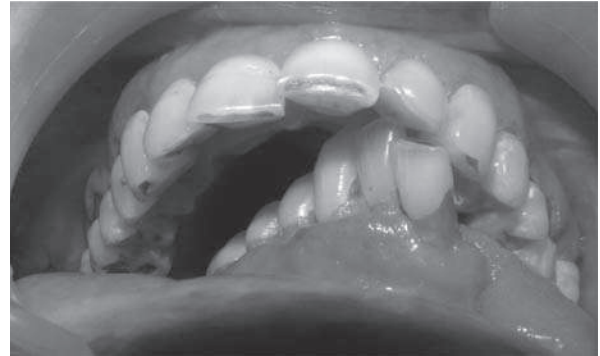
Fig. 2: Deviation of the right half of the mandible resulting in no contact of the upper and lower teeth.