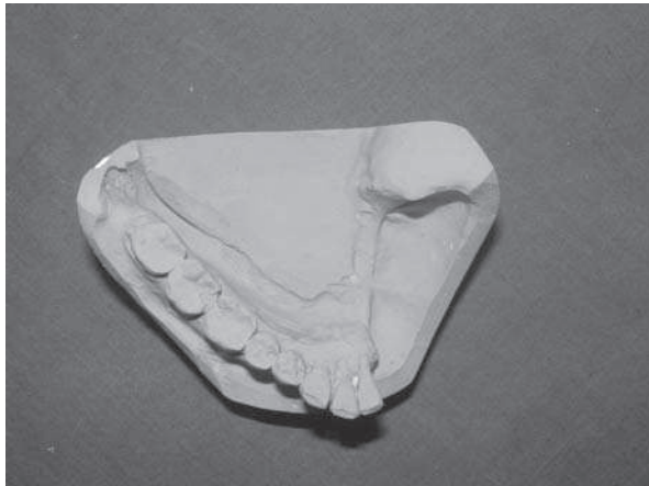
Fig. 3: Mandibular cast showing the remaining teeth and severe contracture of the resected left side of the mandible.